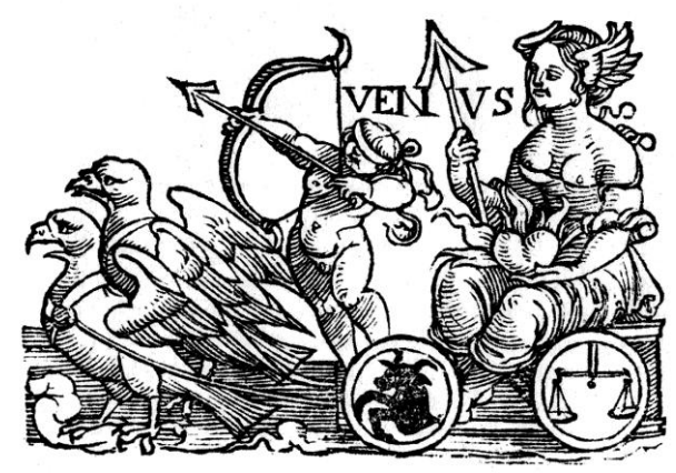
Figure from De imaginum, signorum et idearum compositione.

To dispel any suspicion, provides the same philosopher in De immenso, a work full of autobiographical references, in which his sexual tastes are expressed in unequivocal terms: "because nature created me hirsute, I'll never learn to adapt emeralds to my rough fingers, to curl my hair, to paint my face with a rosy colour, to adorn my head with fragrant hyacinths, to limply pose, to dance sweetly, to distort my voice, as if it came from a tender throat, for not act like a boy, man as I am, and not to become male, female. If they made me so, thanks to the gods, I will preserve what I am, severe, manly strong in the limbs, fearless, indomitable and with a male voice I will say to Narcissus: the nymphs have loved me too."